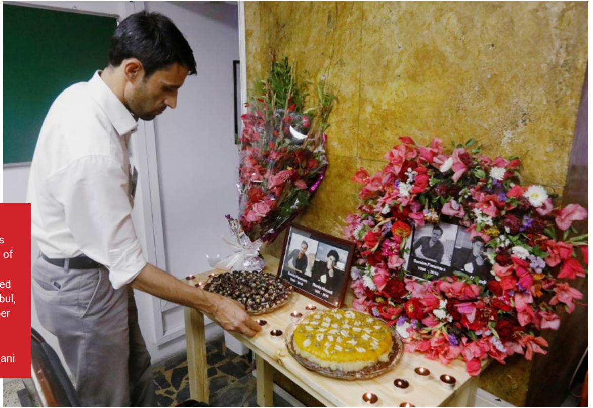
An Afghan journalist working for Tolo News lights candles in front of pictures of his colleagues who were killed in a suicide attack Kabul, Afghanistan September 7, 2018. Picture taken September 7, 2018.