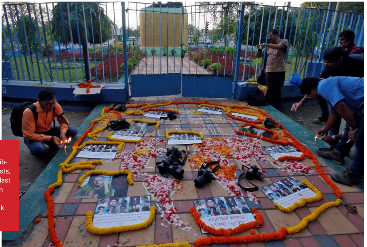
News photographers light candles to pay tribute to Afghan journalists, who were killed in a blast on Monday in Kabul, in Kolkata, India, May 2, 2018.