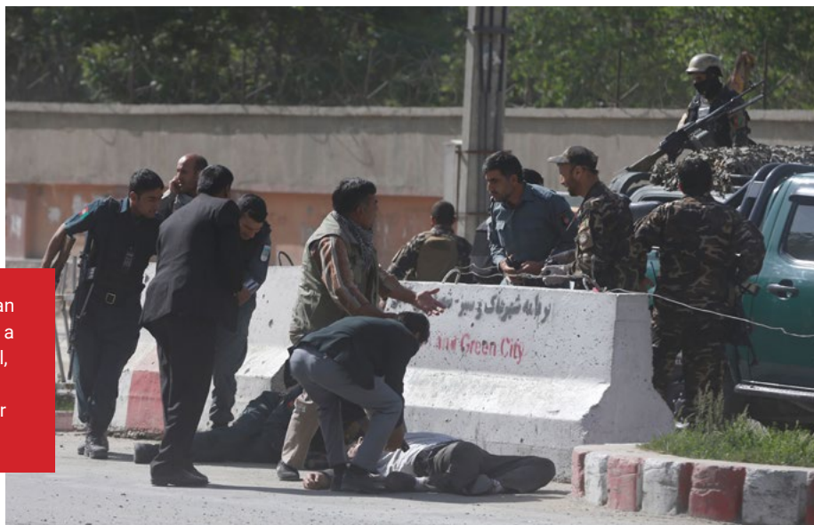
Policemen help Afghan journalists, victims of a second blast, in Kabul, Afghanistan April 30, 2018.

The two suicide attacks hit central Kabul, on 30th April. The first bomb was detonated by an assailant on a motorcycle and the second was detonated 20 minutes later among those who had come to rescue those targeted in the first attack, including a group of journalists.